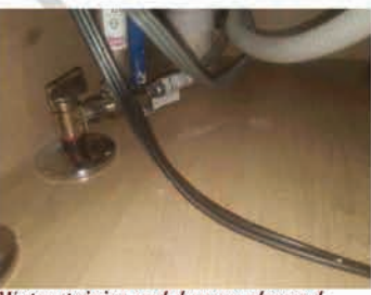
Water staining and damage observed under sink cabinetry.

All areas that have been impacted by moisture will be reported, such as places where there have been leaks, flooding, around windows, or pipes.