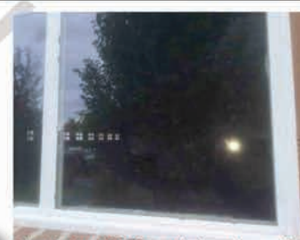
Cracked and broken window observed common Garage.