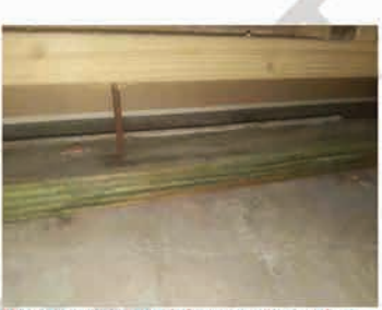
Water staining and damage observed on sill plate.