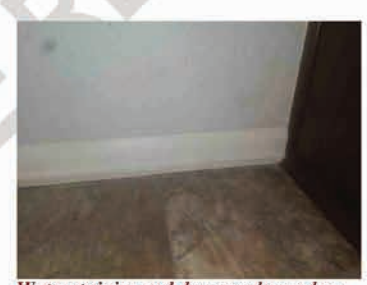
Water staining and damage observed on baseboards around shower and toilet plumbing.