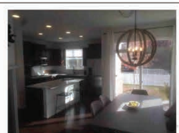
qPCR sample recommended for this area. Suspect area: Kitchen.