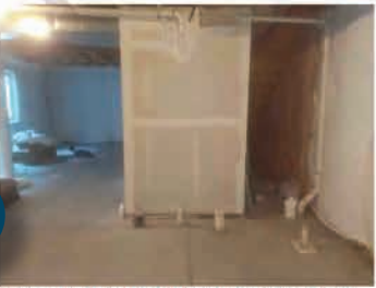
Water staining and damage observed on

Water damage - Moisture staining observed in this