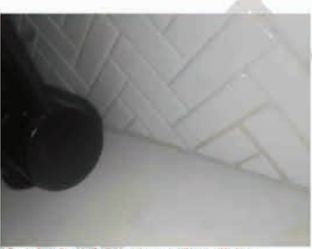
Cracked and deteriorated caulking observed around sink.