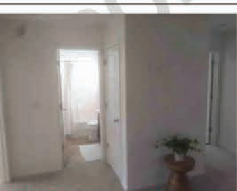
qPCR sample recommended for this area. Suspect areas: Hall Bathroom and Laundry Room.