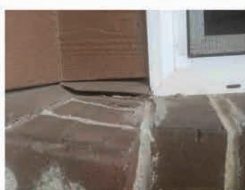
Openings and cracks observed.