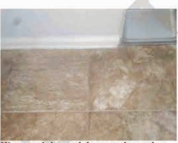
Water staining and damage observed on baseboard and flooring.

source(s)/cause(s): Previous roof leak and/or previous laundry plumbing leak and/or previous Hall Bathroom plumbing leak