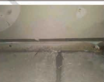
Mold-like growth observed on drywall common Utility Closet.

Evidence of mold-like growth was observed.