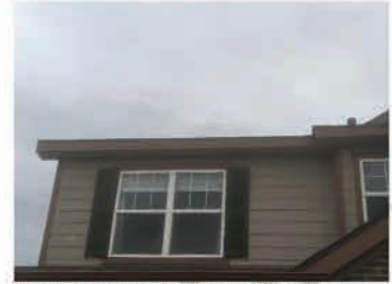
No rain gutters observed on top story of structure.

The structure does not have rain gutters.