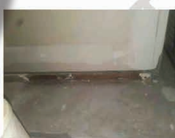
Water staining and damage observed on drywall and sill plate.

Suspected source(s)/cause(s): Previous HVAC / water heater plumbing leak