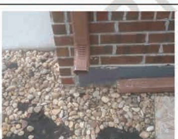
Downspout observed discharging at foundation.

Downspout discharges next to the foundation.